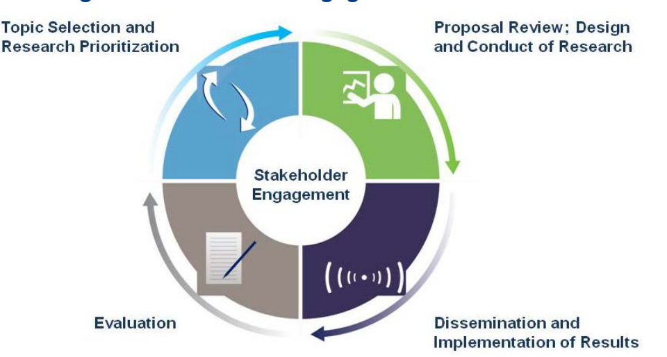
Figure 1. Stakeholder Engagement Is Central

The Patient-Centered Outcomes Research Institute (PCORI) is an independent, nonprofit organization that funds and shares research that compares the effectiveness of various choices that patients, families, healthcare providers, and other stakeholders encounter. It aims to increase the quantity, quality, and timeliness of useful, trustworthy information available to support health decisions; speed the implementation and use of PCOR evidence; and influence research funded by others to be more patient-centered. To attain these goals, stakeholder engagement is central to all PCORI activities from topic selection to evaluation (Figure 1).